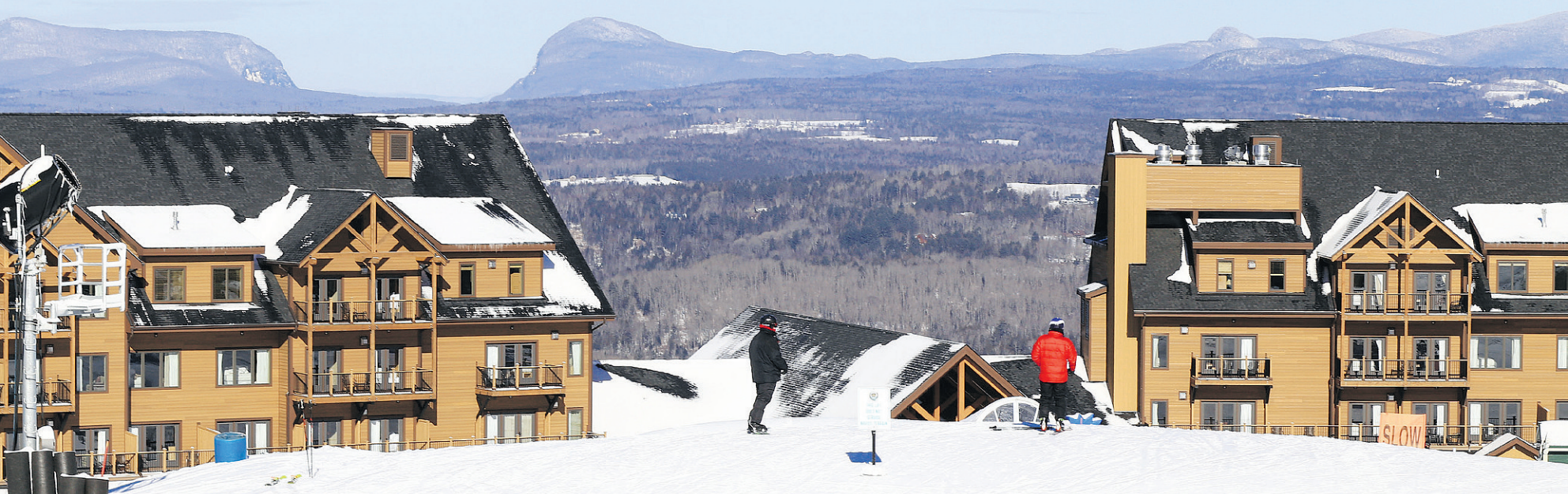
Lift tickets are offered at par for guests at the ski-in, ski-out hotel, plus lodging at par for 50 per cent of your overnight bill.