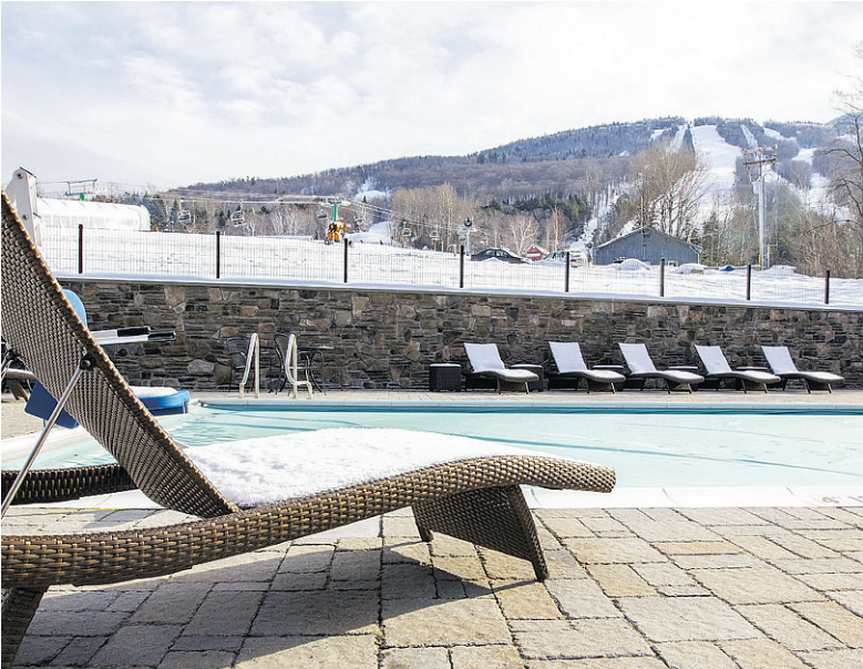
Guests can swim and soak in the outdoor pool and hot tub in an irresistible getaway at the Burke Mountain Hotel and Conference Center in Burke, Vt.

Burke has two personalities: The Lower Mountain is a great learning area, well known for its creative programs, easy glades and gentle slopes; the Upper Mountain is big, broad and challenging, with a front wall of consistent summit-to-base trails. Burke Mountain Academy has launched more than 50 Olympians, including gold medallist and multiple world champion Mikaela Shiffrin. Burke is an official training site for the U.S. National Ski Team. With a towering vertical drop of 2,011 feet (613 metres, about 30 metres shy of Tremblant's vertical), the Upper Mountain is carved with three terrain parks, narrow trails, wide slopes, glades, rugged black-diamond steeps and double-black moguls. Rounding out the snow sports are the Dashney Nordic Center for snowshoeing and cross-country skiing, plus fat-bike fests with guided tours, demos and parties,